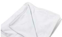
(CBBX-BO) BLOCK-OUT FILM BLOCK-OUT FILM